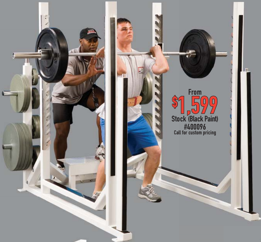
Ultimate Multi-Use Rack

From $1,599 Stock (Black Paint) #400096 Call for custom pricing