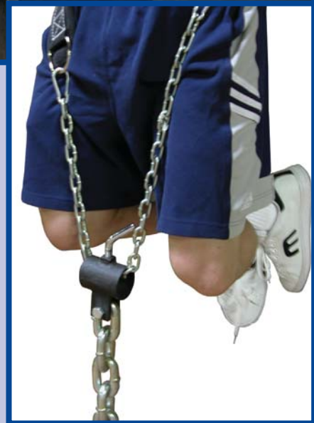
Attaching a chain to a chin/dip belt increases the intensity of the exercise.