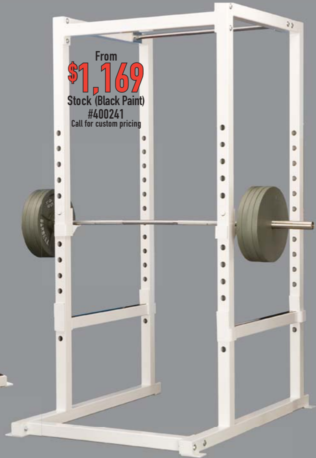
Heavy-Duty Super Cage

From $1,169 Stock (Black Paint) #400241 Call for custom pricing