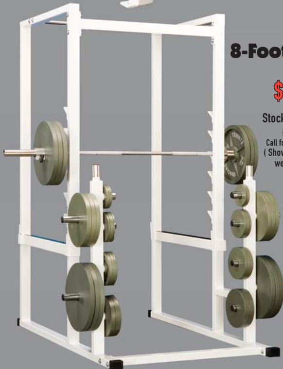
8-Foot Power Rack

From $689 Stock (Black Paint) #400041 Call for custom pricing (Shown with optional weight holder)