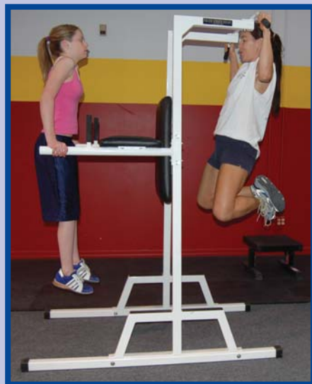
The Chin-Dip V.K.R. (top) enables athletes to perform these two effective resistance training exercises. The Straight V-Dip (right) is the best unit for performing both chest and shoulder dips.