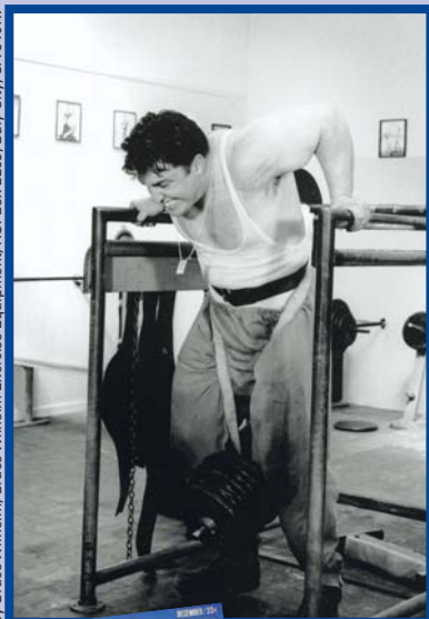
From Pat Casey: King of the Powerlifters by Bruce Wilhelm, Bruce Wilhelm Exercise Equipment, P.O. Box 2289, Daly City, CA 94017.