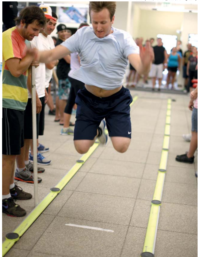
Park City, Utah, training facility.