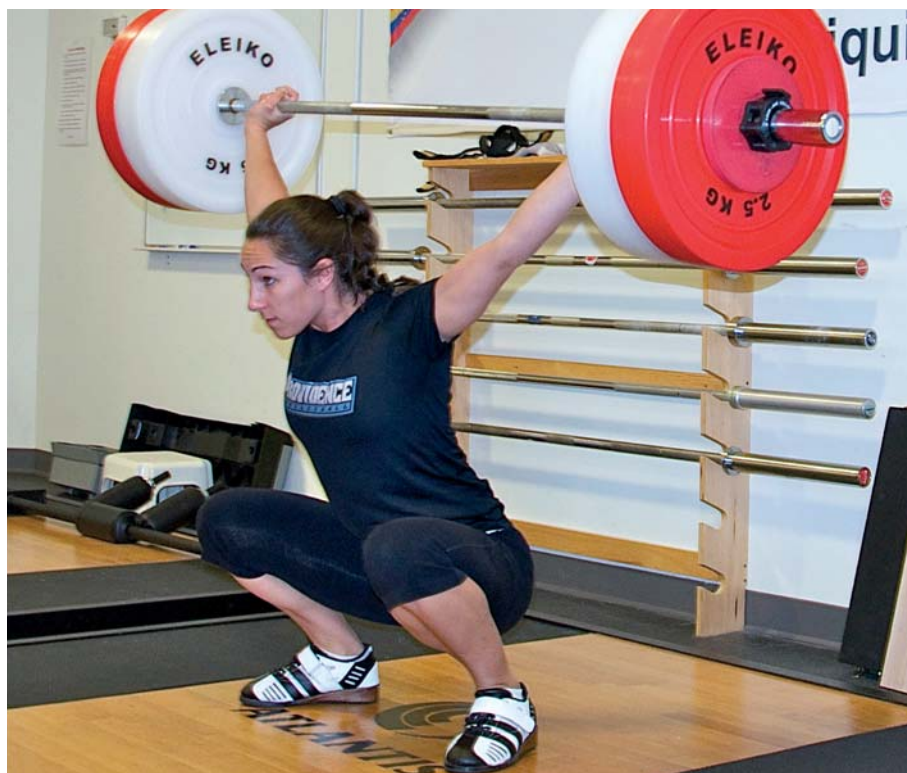
The snatch is a great lift to develop power, strength and flexibility, but these athletic qualities cannot transfer to performance without balance control.

sports writers, fans or parents use words like "dinger" or "getting his bell rung" to describe a concussion. A concussion is a traumatic brain injury and must be taken seriously. This is why we prefer to measure balance control as part of a