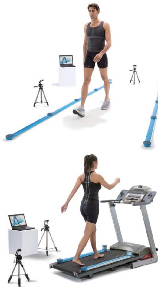
The OptoJump can measure balance control whether the individual is walking, walking on a treadmill or performing complex jumping drills.

the OptoJump system. OptoJump is a light system that precisely measures the contact and flight time of each leg to a millisecond when the subject performs a march-in-place test. Now we can objectively detect a loss of balance or coordination before any coach or doctor can see it with their eyes, subjectively. This is very important, as there are foot-long words to describe medical conditions associated with long-term loss of balance control – none of which we want our young athletes to endure. Whether you're a doctor or a coach, you need to be aware of the importance of balance control for achieving not just optimal performance but also quality of life. BFS