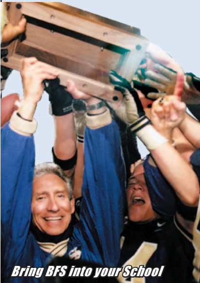
Bring BFS into your School

Exercise Instruction Character Education Coaches Sessions Weight Room Safety Weight Training, Weight Room Evaluation