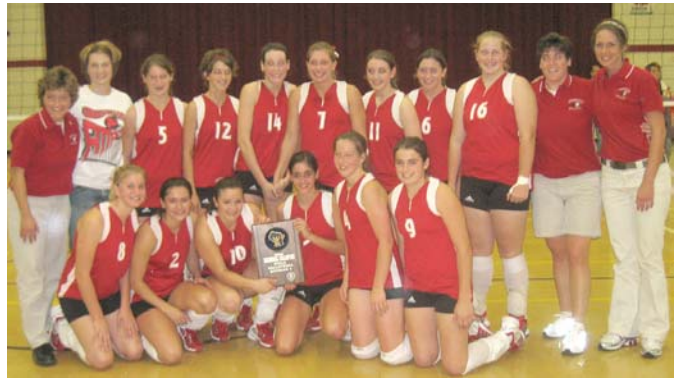
The BFS program made a big impact on the success of the girls basketball and volleyball teams. Shown are the seniors on the basketball team and the girls volleyball team posing after winning the Region 4 Championships.