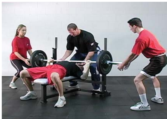
Proper spotting is key to gym safety.

stand how that band works mechanically along with the muscle group that you're working. It's a whole new variable. That being said, I certainly wouldn't recommend bands at the high school level unless the coach was very knowledgeable about using this type of equipment. Also, I don't recommend them because I haven't seen any research that says that bands will make athletes stronger than conventional training, and I read the literature all the time.