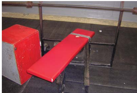
Weight training equipment must be properly maintained to prevent accidents.

understand how to use your equipment safely, effectively and efficiently, then you can't have them use it. What it comes down to is if you're going to present yourself as a professional and