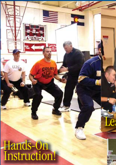
Learn by doing!

Go to www.biggerfasterstronger.com for dates and times.