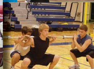
Learn Perfect Technique!