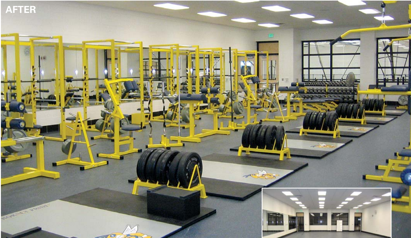
Careful planning helped make Saline High School in Saline, Michigan, one of the best equipped and safest weightrooms in the country.