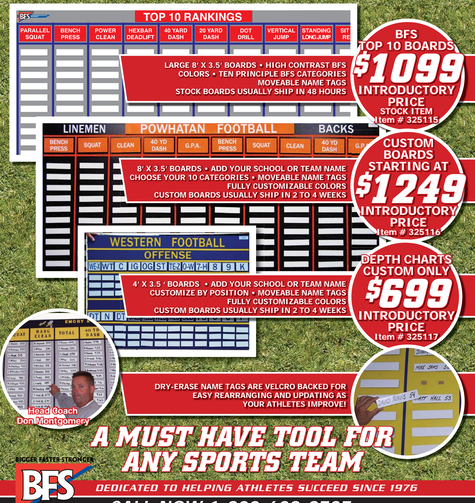
CHART YOUR PATH TO SUCCESS TOP 10 MOTIVATIONAL BOARDS AND DEPTH CHARTS