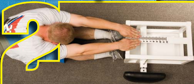
Sit and Reach