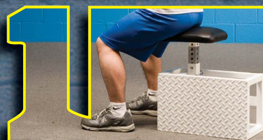
The Box Squat