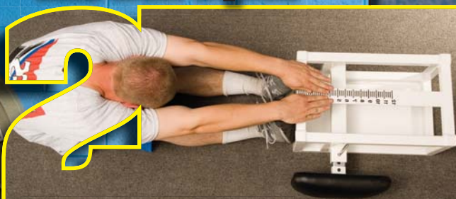
Sit and Reach