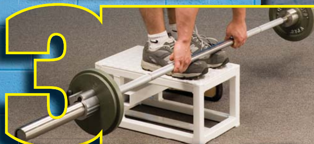
Straight Leg Dead Lift