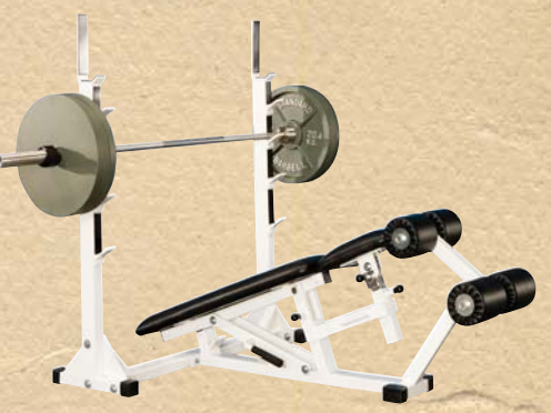
The BFS Olympic 4-in-1 bench enables this valuable exercise to be safely performed from three angles.

apparatus that enables the exercise to be performed from a standing position and also with one arm at a time. Because the shoulder blades are not pinned against the bench, the motion is more natural and places less stress on the upper body. And because it is performed from a standing position, more muscle groups are involved.