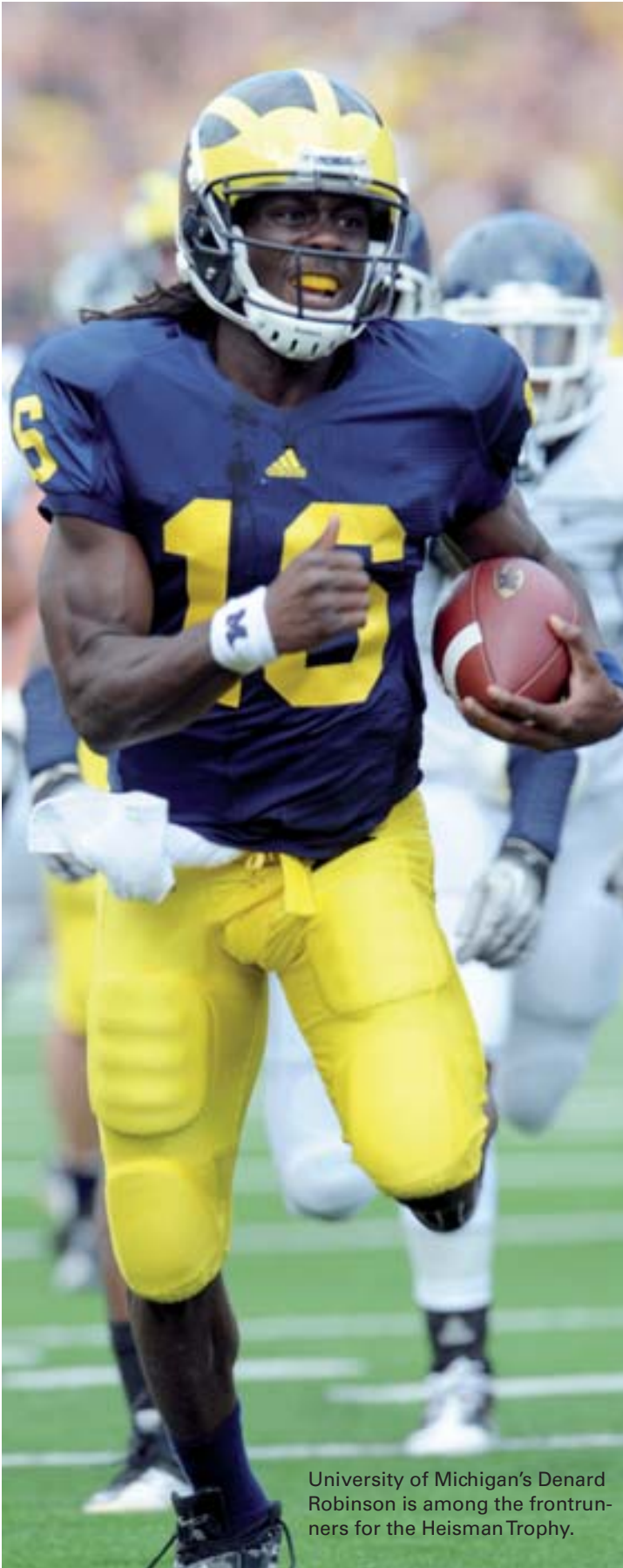
University of Michigan's Denard Robinson is among the frontrunners for the Heisman Trophy.