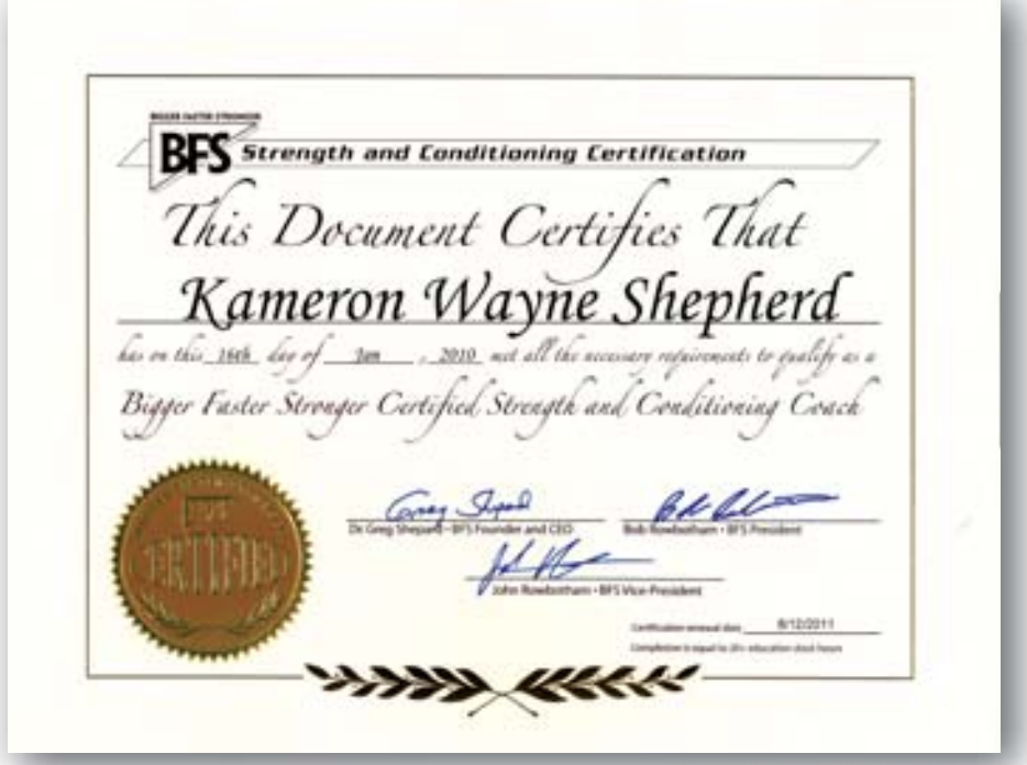
The prize that is in store for those who complete the hands on training at a BFS certifica

Mergardt's next goal is to introduce many more coaches and athletes to the value of BFS, not just in athletic fitness but also in physical education.