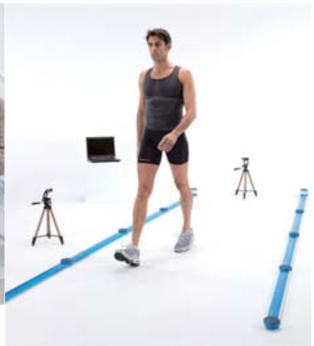
A concussion can alter the athlete’s gait print, and as such a history of OptoJump readings will provide objective data about the athlete’s readiness to return to play.