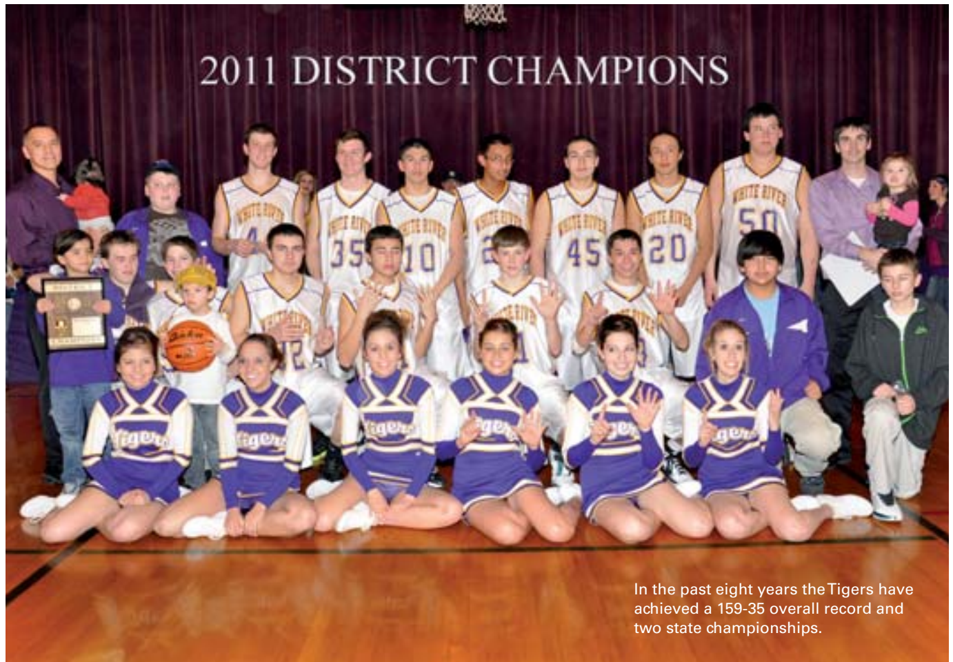
In the past eight years the Tigers have achieved a 159-35 overall record and two state championships.