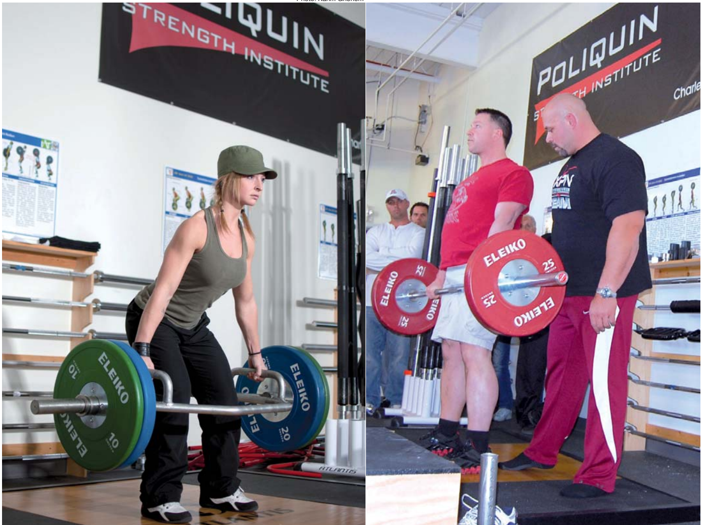
The hex bar deadlift vs. the straight bar deadlift: both great exercises, but which one is better?

Hexagonal Barbell Deadlifts Using Submaximal Loads” discusses a study that compares the training effects of a straight barbell to a hex bar. Among the biomechanical values studied were peak