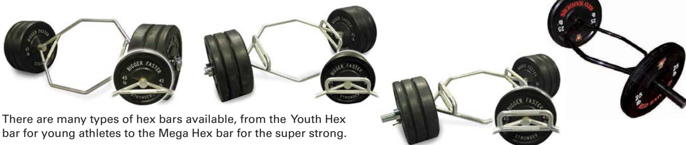
There are many types of hex bars available, from the Youth Hex bar for young athletes to the Mega Hex bar for the super strong.

less stress on the lumbar spine when compared to the straight bar deadlift and that it has a much higher transfer to power development than previously thought. As this new research confirms and as Coach Shepard has always said from the first time he used a hex bar more than 15 years ago, the hex bar is a superior exercise and should be a part of any athlete’s program. BFS