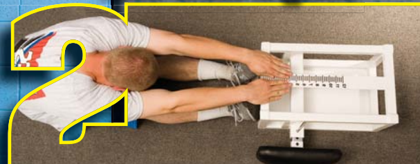
Sit and Reach