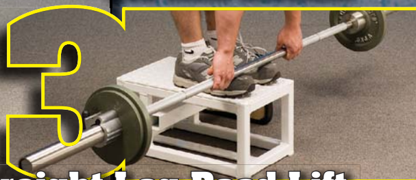
Straight Leg Dead Lift