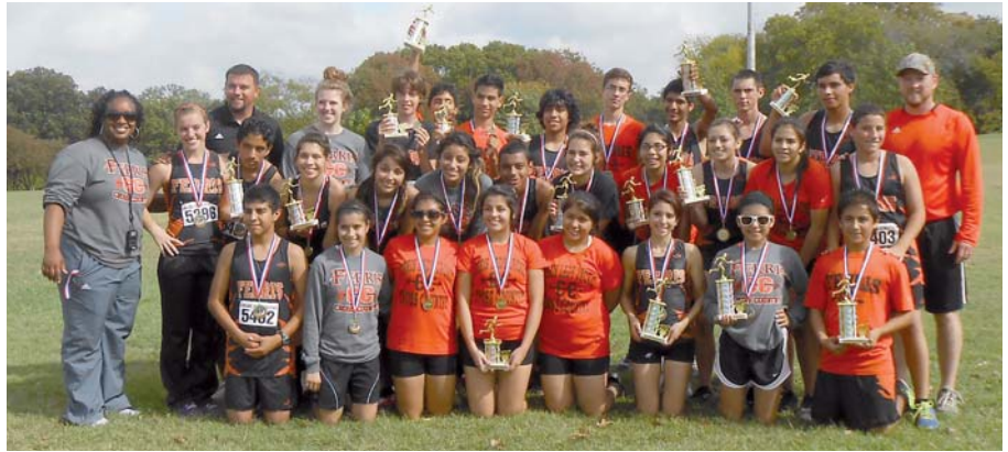
The Ferris High School boys and girls cross country teams and the girls volleyball team won district titles.

Ferris High School uses the BFS program exactly as it is intended to be used. This year they have definitely raised the bar and look to enjoy even more success. BFS