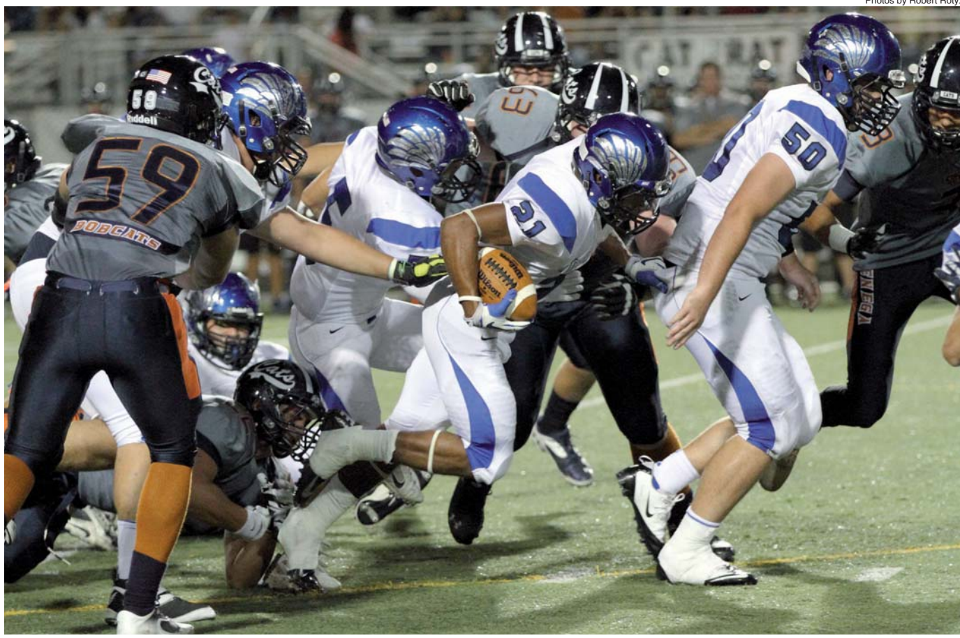
Catalina Foothills finished the 2012 season with a 0-10 record, but in 2013 they won eight games and made the playoffs.