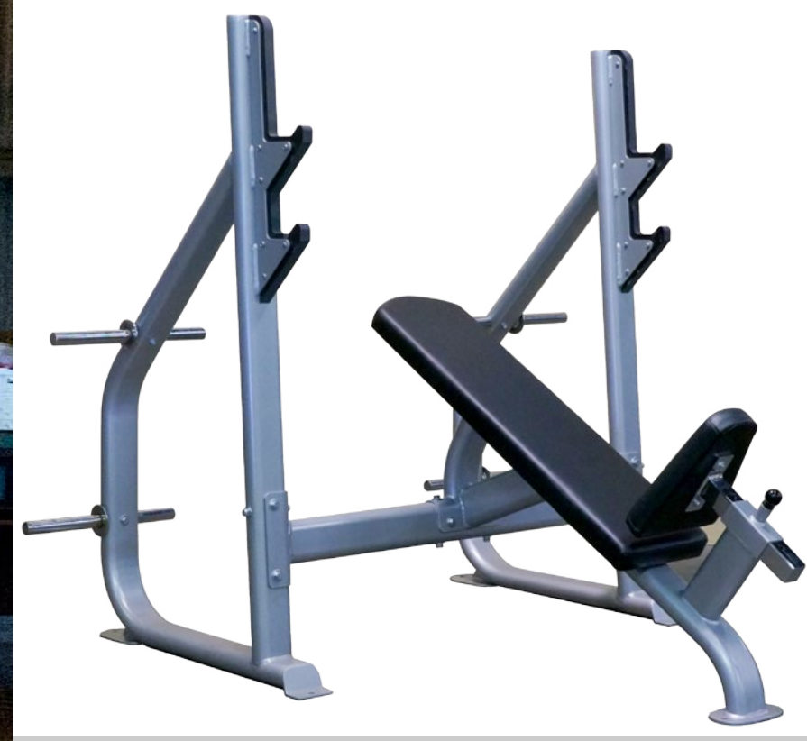
The BFS Absolute Line offers many unique, popular designs featuring V and U shapes.

were willing to pay top dollar. BFS was fortunate to have developed solid, long-term relationships with many US steel manufacturers that could fulfill our needs, but other companies were not so fortunate and found they could not stay in business. The steel crisis eventually passed, but as a safeguard BFS built a 5,000-square-foot storage facility to stockpile steel, enabling us to fill our orders and also keep our prices down.