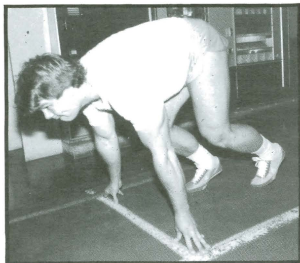
Produce a 4.3 Forty!!!