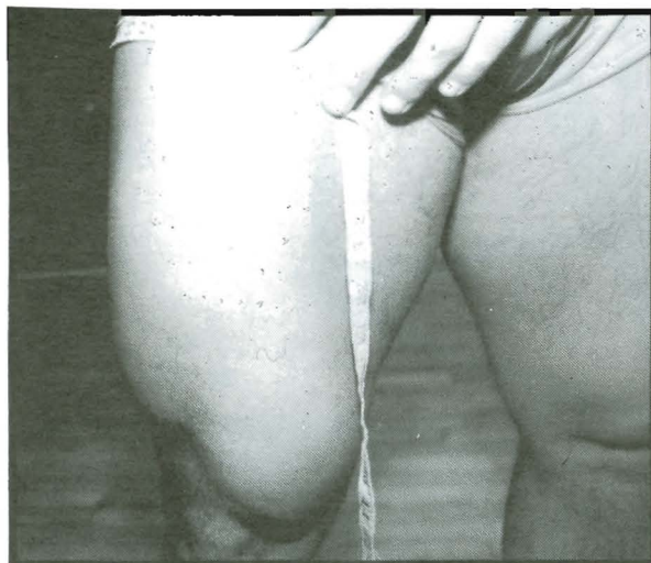
These powerful 31" thighs which . . .