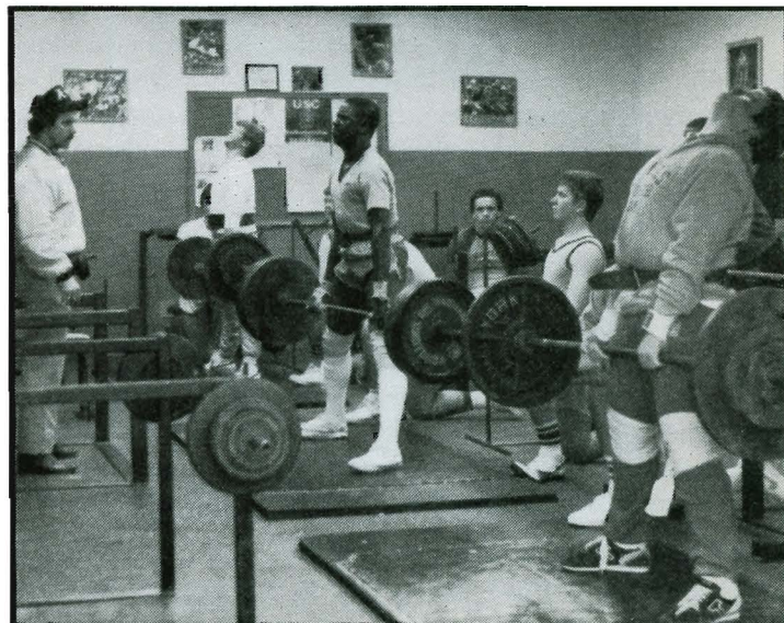
Work together as a team to build pride and confidence. 25