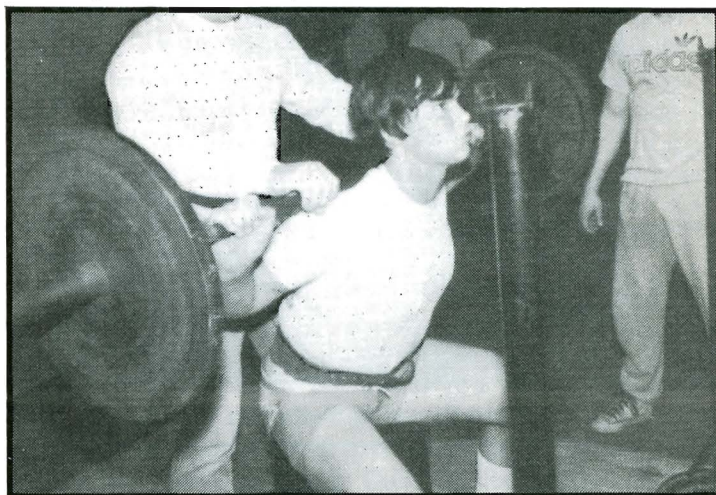
Dwell on the good: As kids make progress continually be positive.