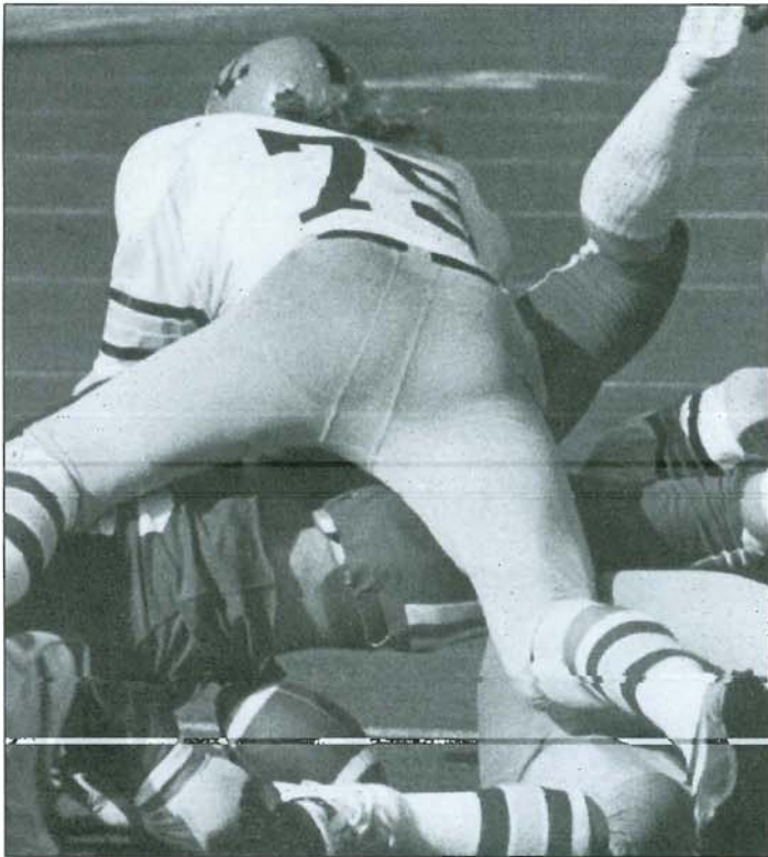
Templeton's Defense Held Hamilton Scoreless the First Half