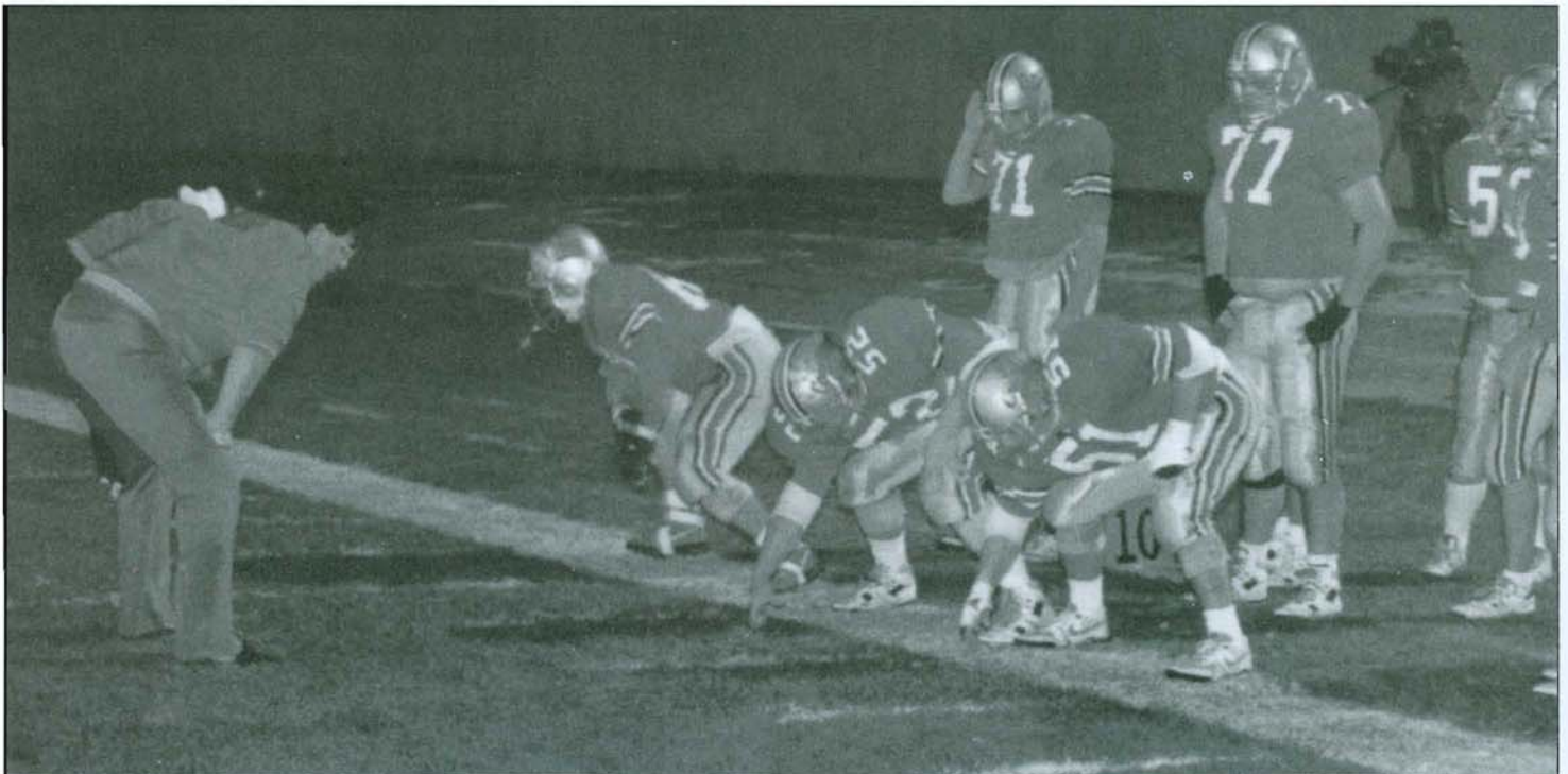
PRE-GAME WARM-UPS AT THE DOME IN FRONT OF 25,000 FANS!