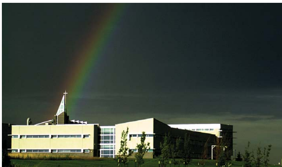
Holy Family High School offers its students the finest facilities in the country.

Next up for the Tigers was rival Kent Denver and an opportunity to assure our eligibility for the league playoffs. Kent Denver had other plans, and handed the Tigers their second loss of the season, 28-20. Two losses meant that