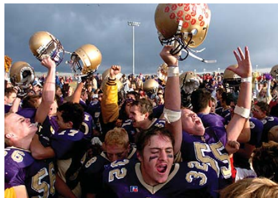
The Championship Tigers

It was a dramatic end to an up-and-down season – just like in the movies. A wild card football team that had barely made the playoffs became the Cinderella team of the season. Our hopes became reality because of the structure, discipline and work ethic our team learned through the Bigger Faster Stronger program.