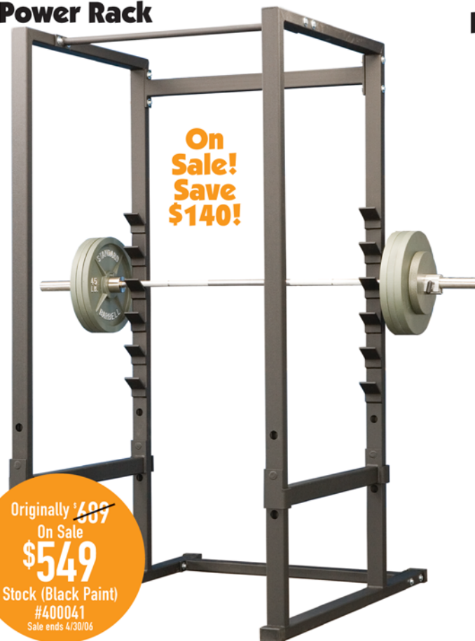
8-Foot Power Rack