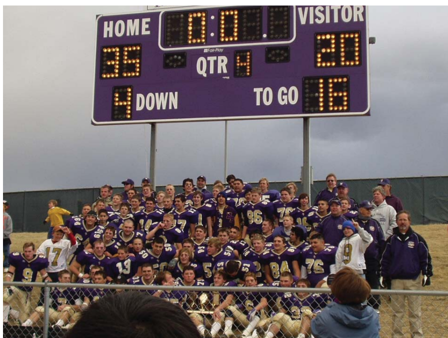
It's Worth It!